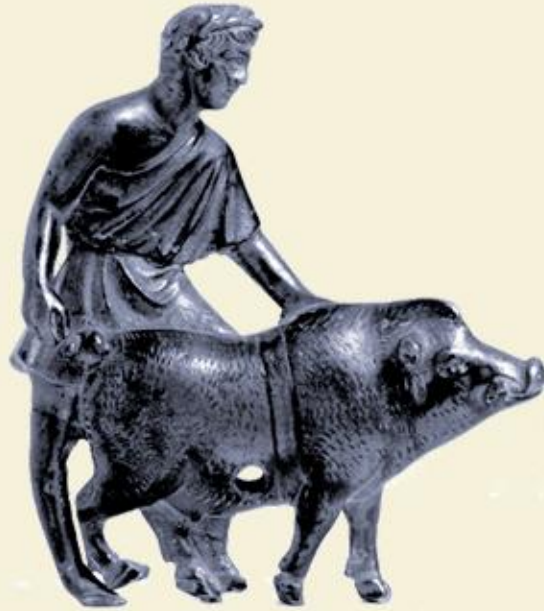
Antiochus Epiphanes IV